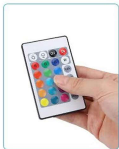
5. Tear off isolation layer to turn on the light.