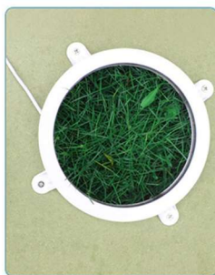
3. Install four screws along the holes.