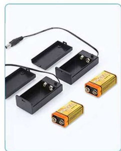
4. Use 9V battery (Not Included), stick it