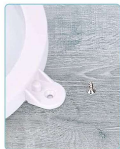
1. Arrange the position of light edge