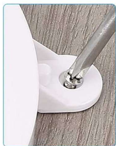
2. Lock the screws tightly.