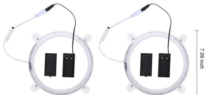
2 cornhole lights/2 battery boxes