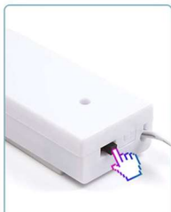
5. Slide to open