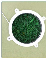
3. Install four screws along the holes.