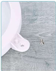
1. Arrange the position of light edge