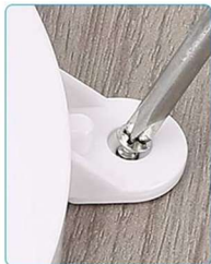
2. Lock the screws tightly.