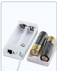
4. Use 9V battery (Not Included), stick it