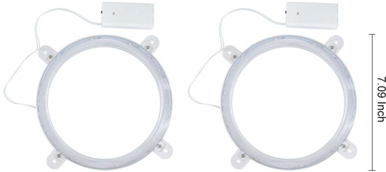
2 Cornhole lights/2 Battery boxes